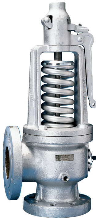
Model 300 and 600

ASME Section I Steam, and ASME Section VIII Air/Gas/Steam